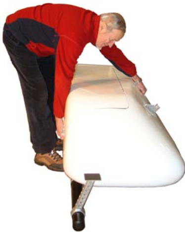
Handles for easy installation