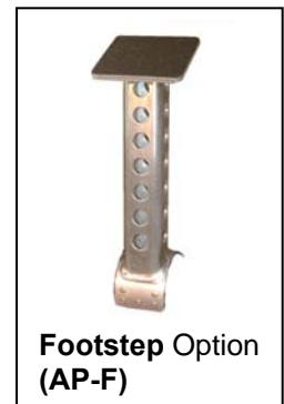
Footstep Option (AP-F)