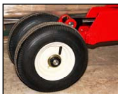
Pneumatic wheels On V1020

Large Pneumatic Traction wheel 16"x 6" (40 x 15cm) For challenging terrain