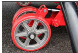
Hard wheels on V1022 & V1030