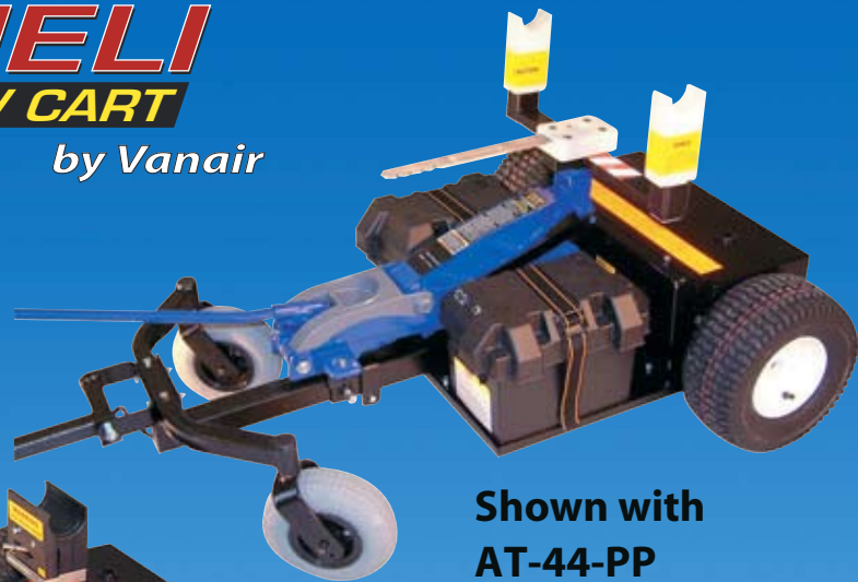
Shown with AT-44-PP