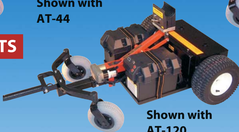
Shown with AT-120